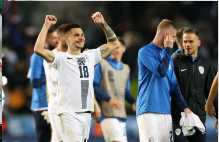
Slovenia vs Norway (2:1) UEFA Nations League 24 September 2022, Ljubljana