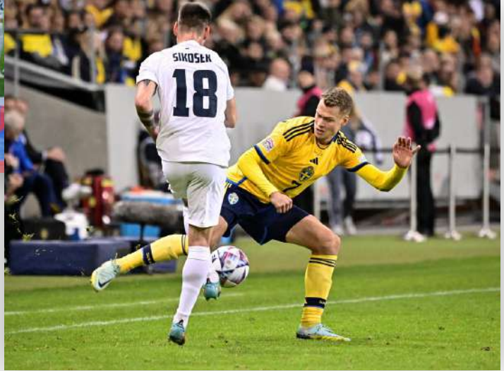
Sweden vs Slovenia (1:1) UEFA Nations League 27 September 2022, Stockholm