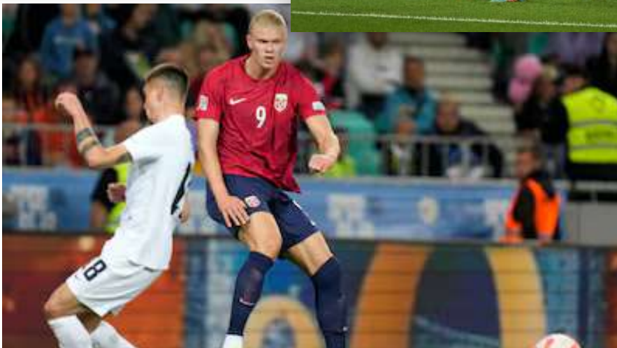
Slovenia vs Norway (2:1) UEFA Nations League 24 September 2022, Ljubljana Sikošek and Haaland