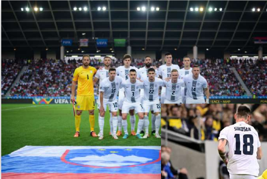
Slovenia vs Sweden (0:2) UEFA Nations League 02 June 2022, Ljubljana