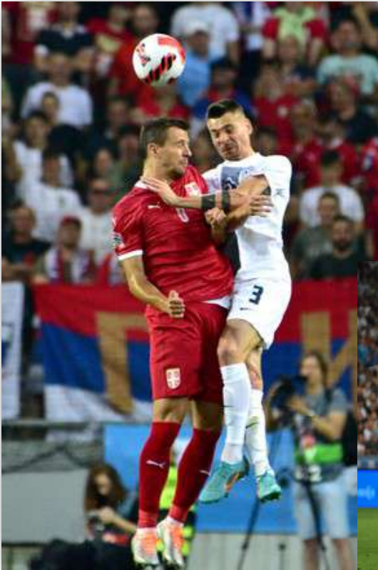
Slovenia vs Serbia (2:2) UEFA Nations League 06 December 2022, Ljubljana